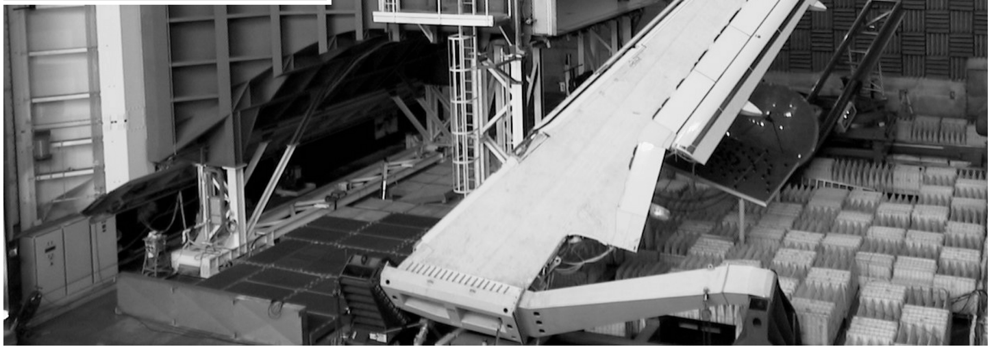
Figure 3. Photograph and source strength visualisation from full-scale test of an Airbus A320 wing in the German Dutch wind tunnel (DNW).

Visualization of Source Strength from Microphone-Array Data